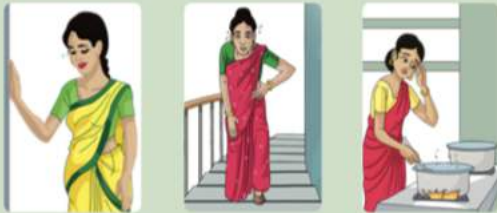
Lack of interest in work.